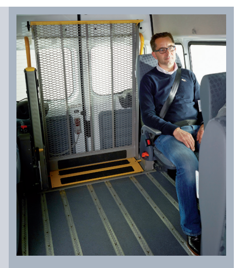
See-through platform design ensures excellent rear view.