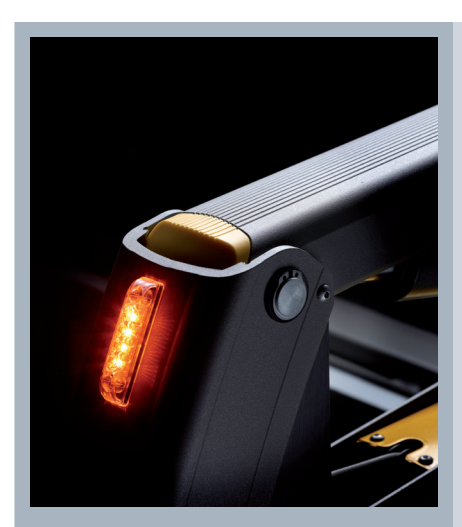
Worldwide unique design due to the specially manufactured aluminium profile lifting arms.